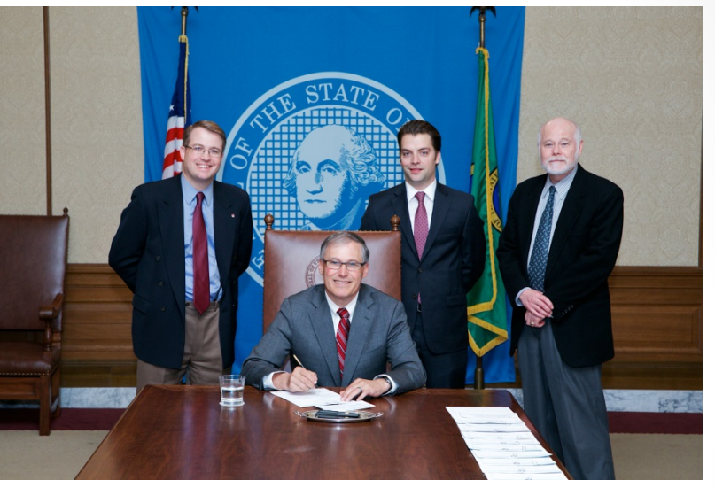
Above: Governor Jay Inslee signing SB 5180 May 14, 2013

Senate Bill 5180 creates a task force to improve access to postsecondary education for students with disabilities. The goal of the task force is to develop recommendations that will directly increase the success rate for